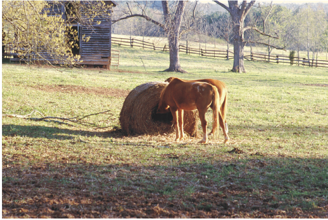
Figure 3. Horses often refuse to eat the outer areas of weathered round hay bales. The outer area of this bale was moldy, so only a limited amount of the bale was consumed.

off the ground and by covering them with a tarp to shed rainfall. Round bales can be an economical forage source, but like small square bales, must be stored properly.